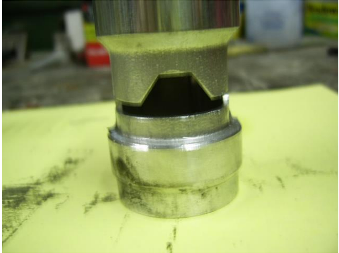
Tophat showing the cut outs that control cold idle.