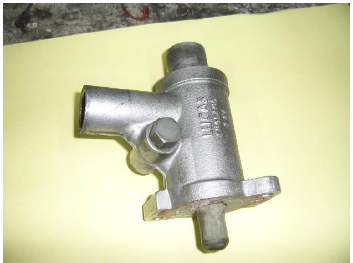
AAV as removed from the engine

The 12 photos accompanying are in order of one I just did tonight, and have captions that explain what you see. It took me 20 minutes to complete, and the JB Weld is drying overnight prior to returning it to the engine.