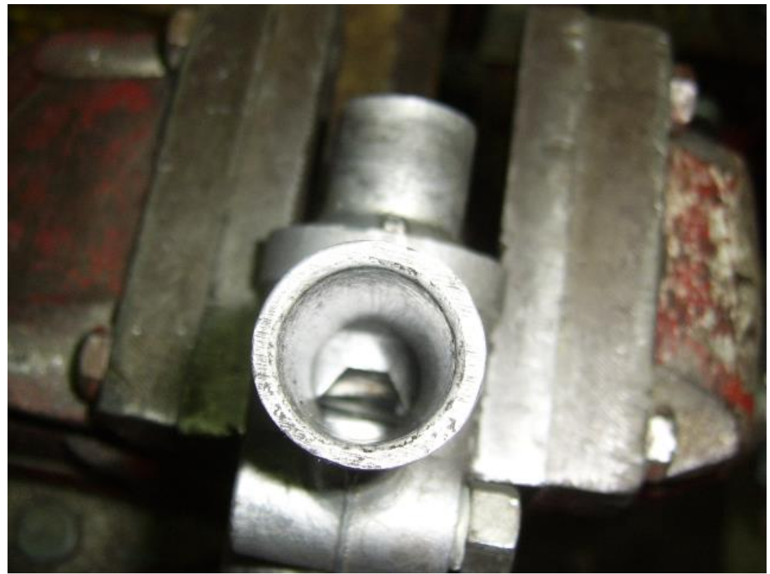
AAV as it is when cold or jammed