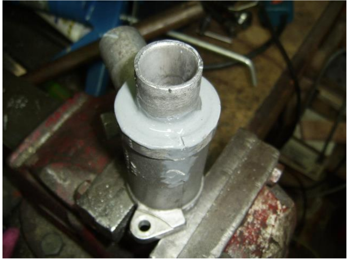
Completed unit with JB weld in place.