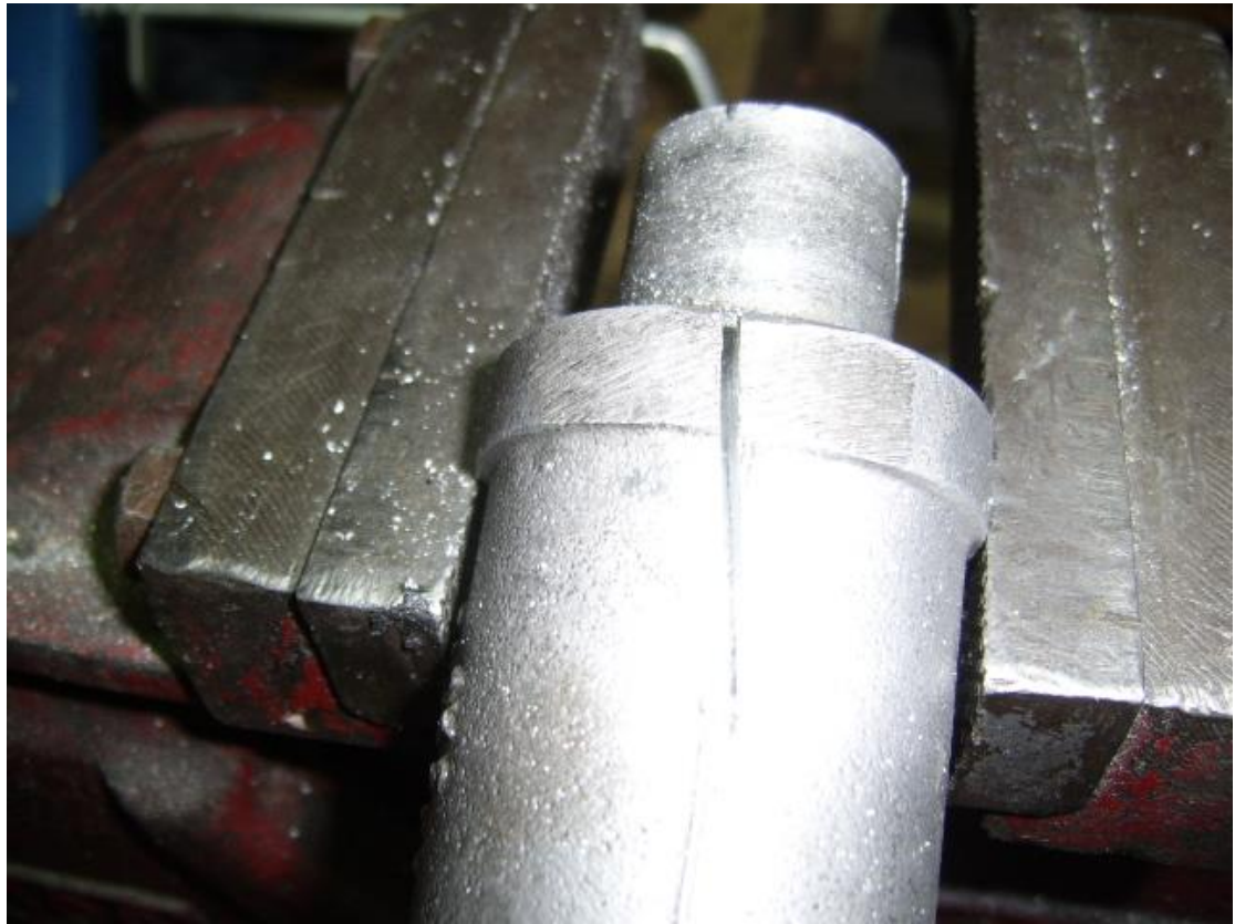
The CUT to release the grip