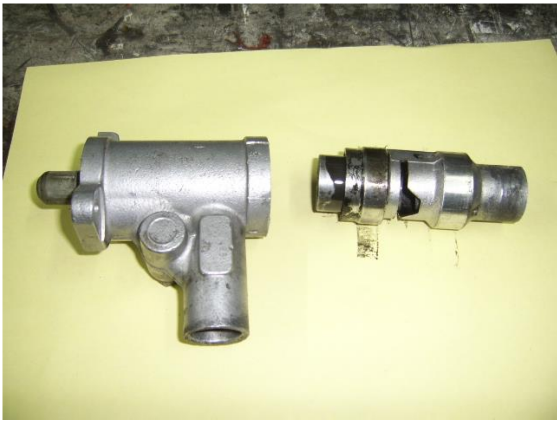
Body on the left and Tophat assembly on the right