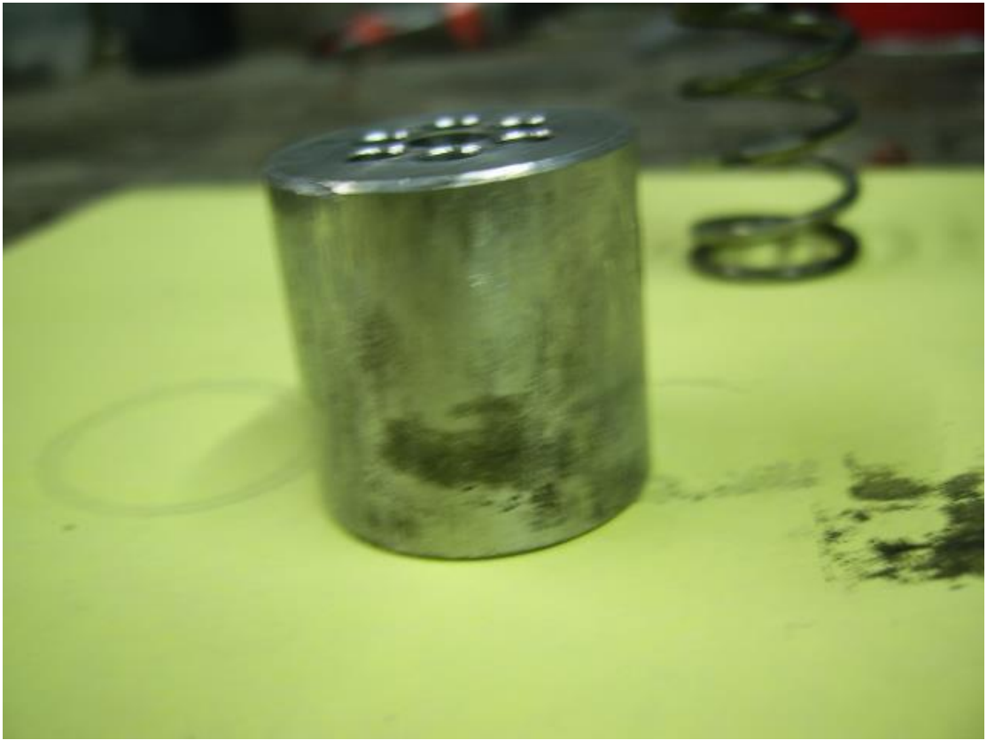
Alloy piston showing scores and carbon build up