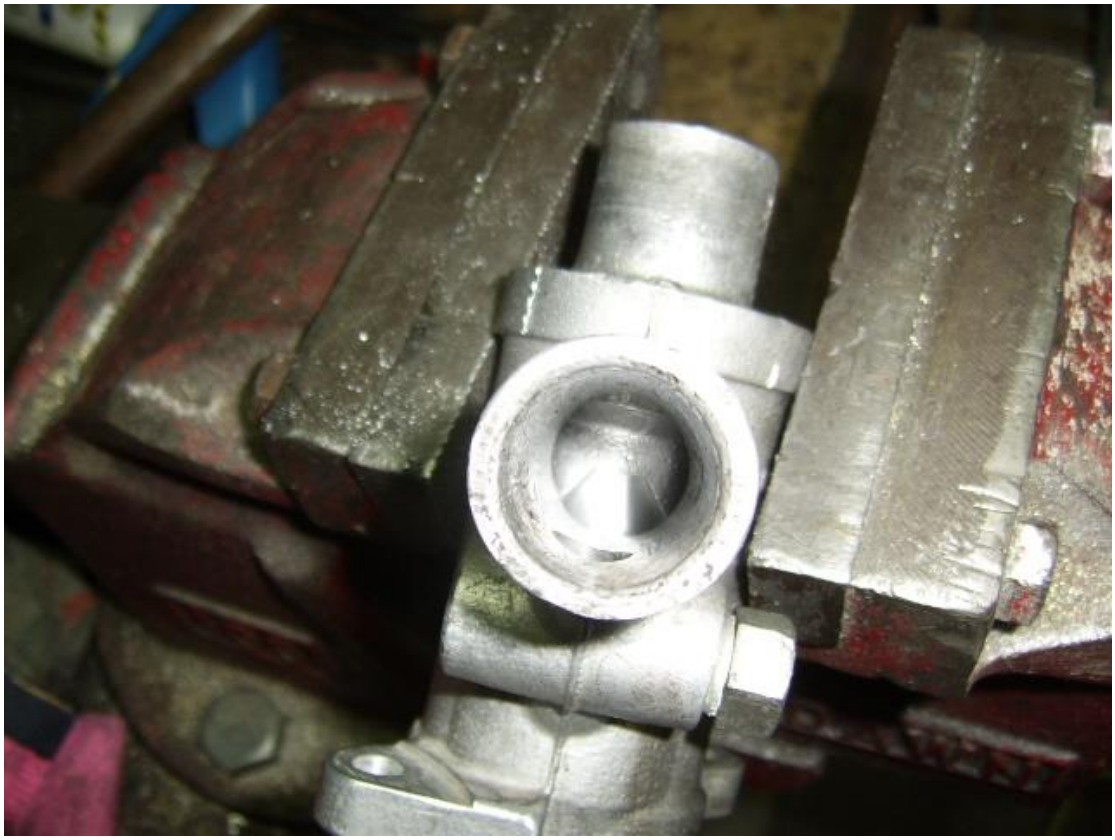
2nd test, PASS 100% closed.